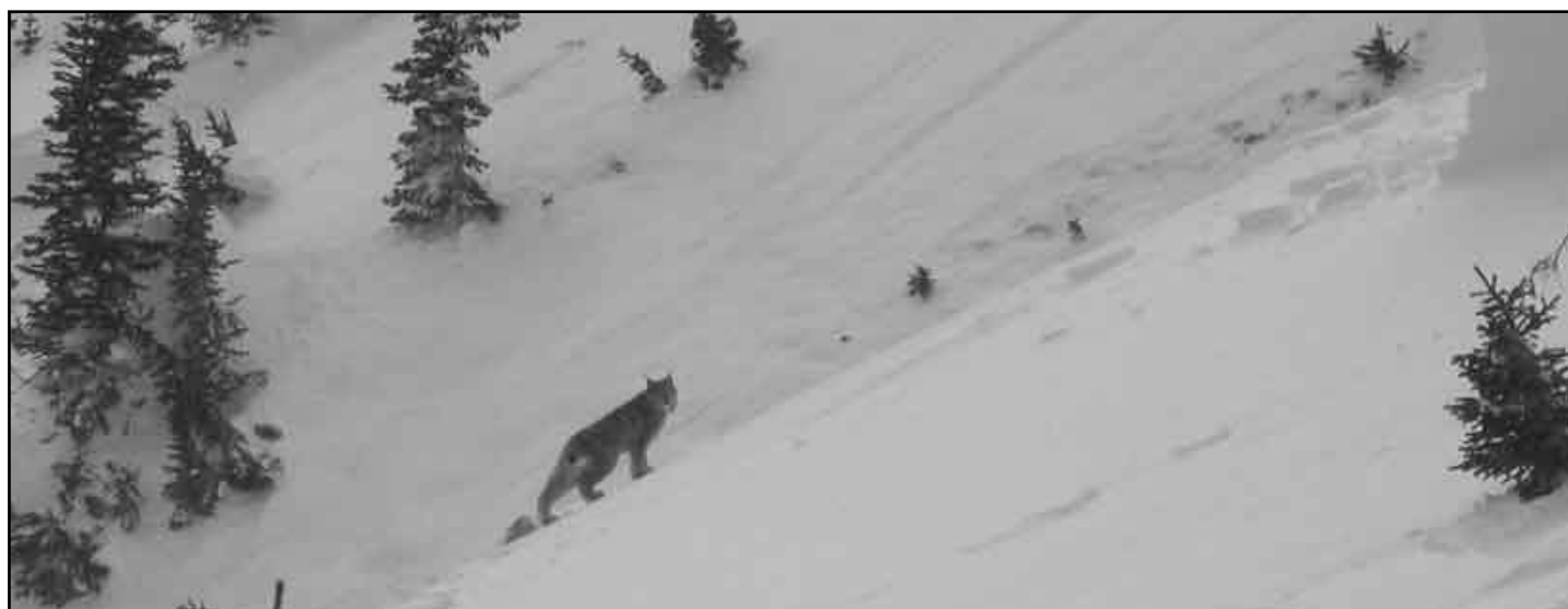
Lynx spotted walking up an avalanche bed surface 1/4 mile from Francie's Cabin, January 2008